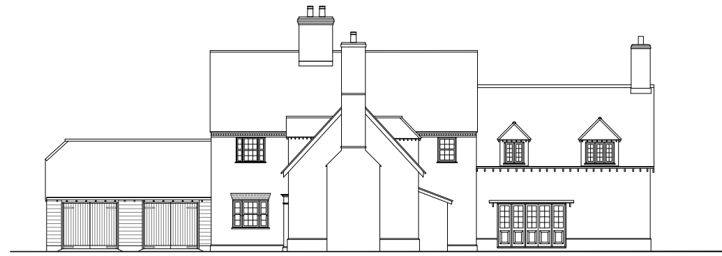
Side & Garden Elevation