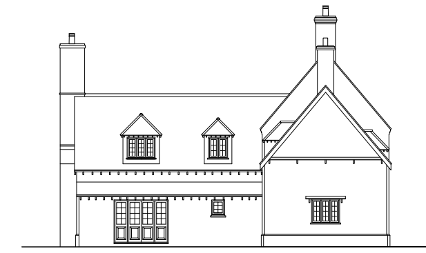
Side & Garden Elevation